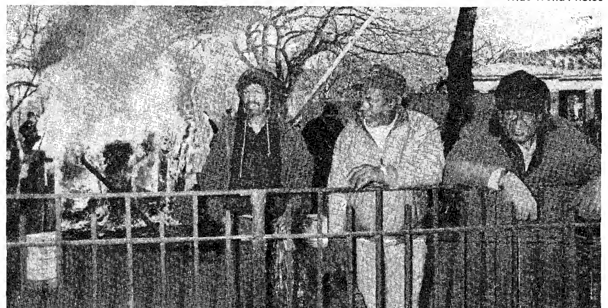
Homeless men set fire to their shelters in Tompkins Square Park, New York City, protesting police eviction.

One woman putting on jeans, a sweater, and a ski jacket is a public relations ploy, not an outreach initiative. ●